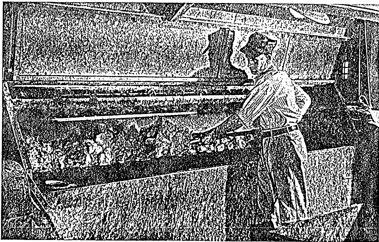
Making GARLOCK 7021 Compressed Asbestos Sheet Packing at the Garlock factory.